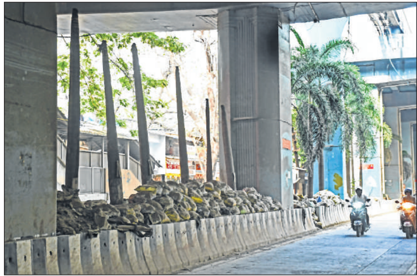
Choking under neglect Palm trees at Sant Gadge Maharaj Chowk monorail station wither away, suffocated by debris and garbage-filled divider

The minister recently visited Germany to study advanced food storage and shelf-life enhancement methods. He said the visit helped the state understand how similar models could be adapted to Indian conditions. The new technology is expected to maintain freshness, prevent spoilage, and reduce wastage on a large scale. Officials said the technology can keep ready-to-eat items like chapatis fresh for up to six months, while onions and fruits can be preserved for six to eight months.